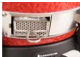
Patented Ash Collector