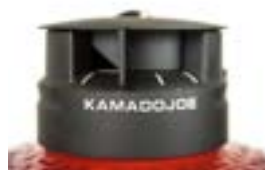
Kontrol Tower Top Vent