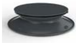
Patented Hyperbolic Insert