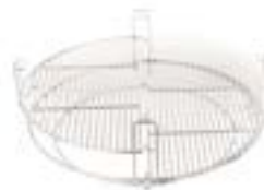
Divide & Conquer® System