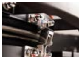
Stainless Steel Latch