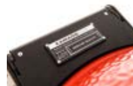
Air Lift Hinge