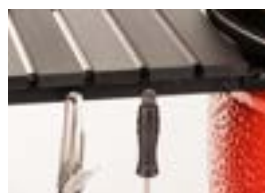
Aluminum Side Shelves