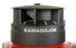
Kontrol Tower Top Vent