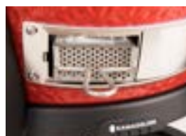
Patented Ash Collector