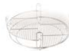
Divide & Conquer® System