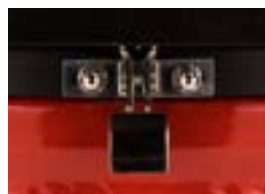
Stainless Steel Latch