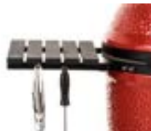
Aluminum Side Shelves