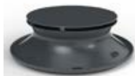
Patented Hyperbolic Insert